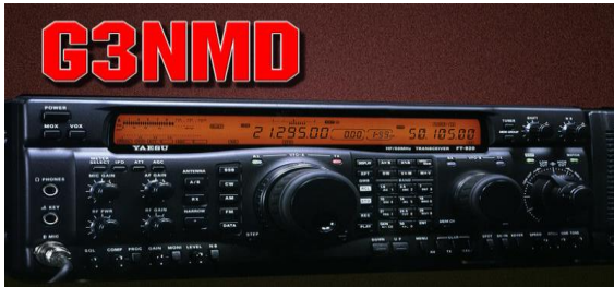
G3NMD Newsletter Houghton-le-Spring ARC